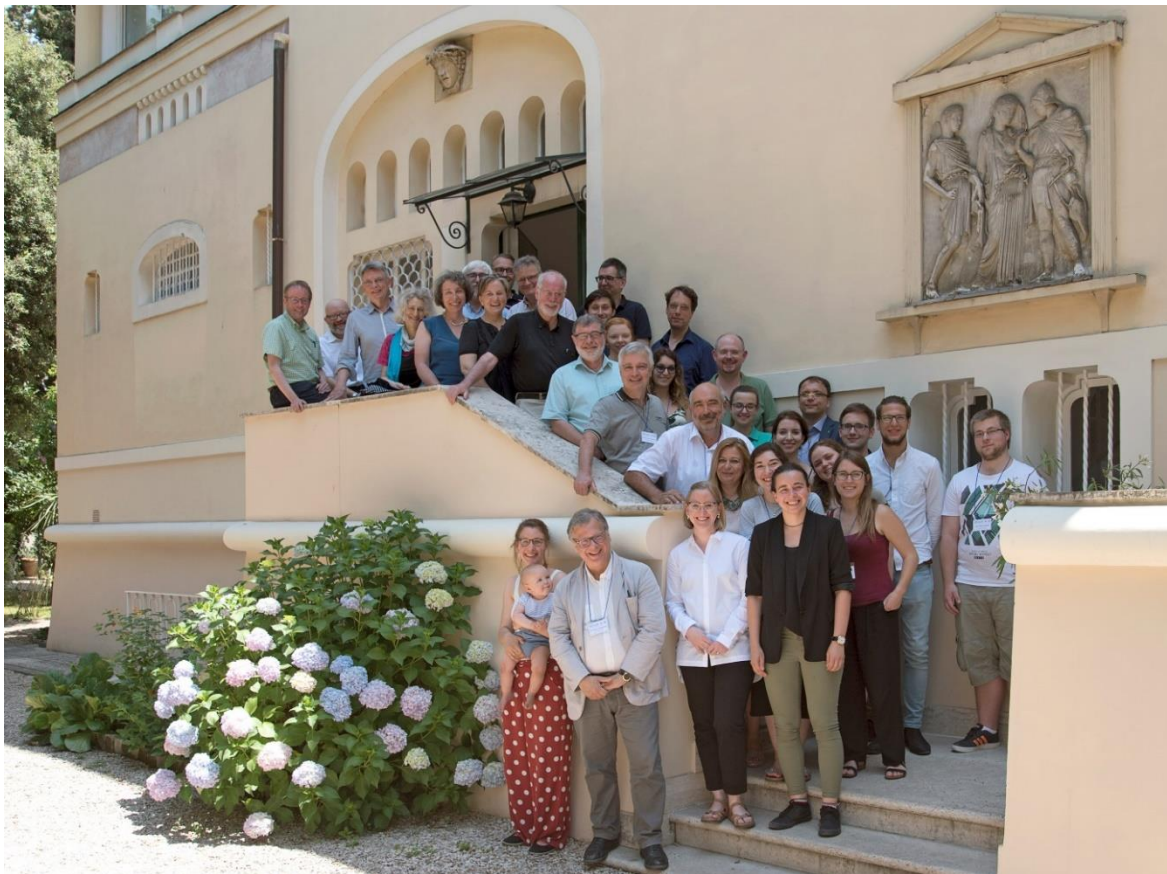
Participants of the 2019 EMCC Intensive Course in front of the DAI guest house 'Villino Amelung' in Rome.

By integrating this interdisciplinary Intensive Course into the curriculum of the European Master, students from different European countries are given the opportunity to get to know each other, exchange ideas, and establish contacts with the responsible coordinators during the Course and beyond. During this Course, all students give a